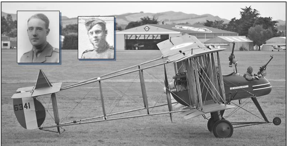
Pictured (inset) are 2 nd Lt. Thompson (left) & 2 nd Lt. Parks (right) and the type of aircraft they were flying at the time of the fatal crash.

An Upwood resident has been leading a campaign to gain recognition for the only two airmen to actually lose their lives over Upwood Airfield during World War 1. Turn to page 5 for details of the date, time and place where the service will take place. All Parishioners are warmly welcome to attend this ceremony.