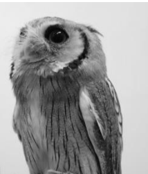
Goliath, a White Faced Owl