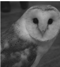
Trevor, a female Barn Owl

After a break for coffee we were treated to a flying display. Trevor and Topaz separately swooped to and fro across the audience and there were many 'oohs' and 'ahhs' from the enthralled people. Finally it was the turn of Gem, the Harris Hawk who again excited by flying centimetres above our heads