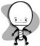
TABLE TENNIS CLUB

The Ladies Singles annual club tournament was held on Tuesday 29 September. The standard of play was high and was played in very good spirits. The Gents' Singles tournament will be held on Tuesday 6 October. It starts at 7.30pm and spectators would be very welcome to attend this entertaining evening. There will now be a coaching session every month for our less experienced players to help improve the general club standard.