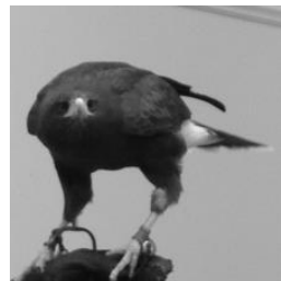
Gem, a Harris Hawk

An unusual thing about Harris Hawks is that they hunt in packs instead of operating as solitary hunters. Groups typically include from 2 to 7 birds and not only do birds co-operate in hunting, they also assist in the nesting process.