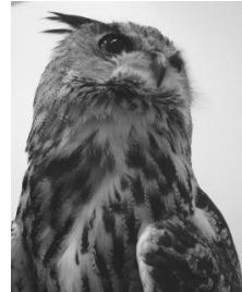
Sharni, an African Spotted Eagle Owl